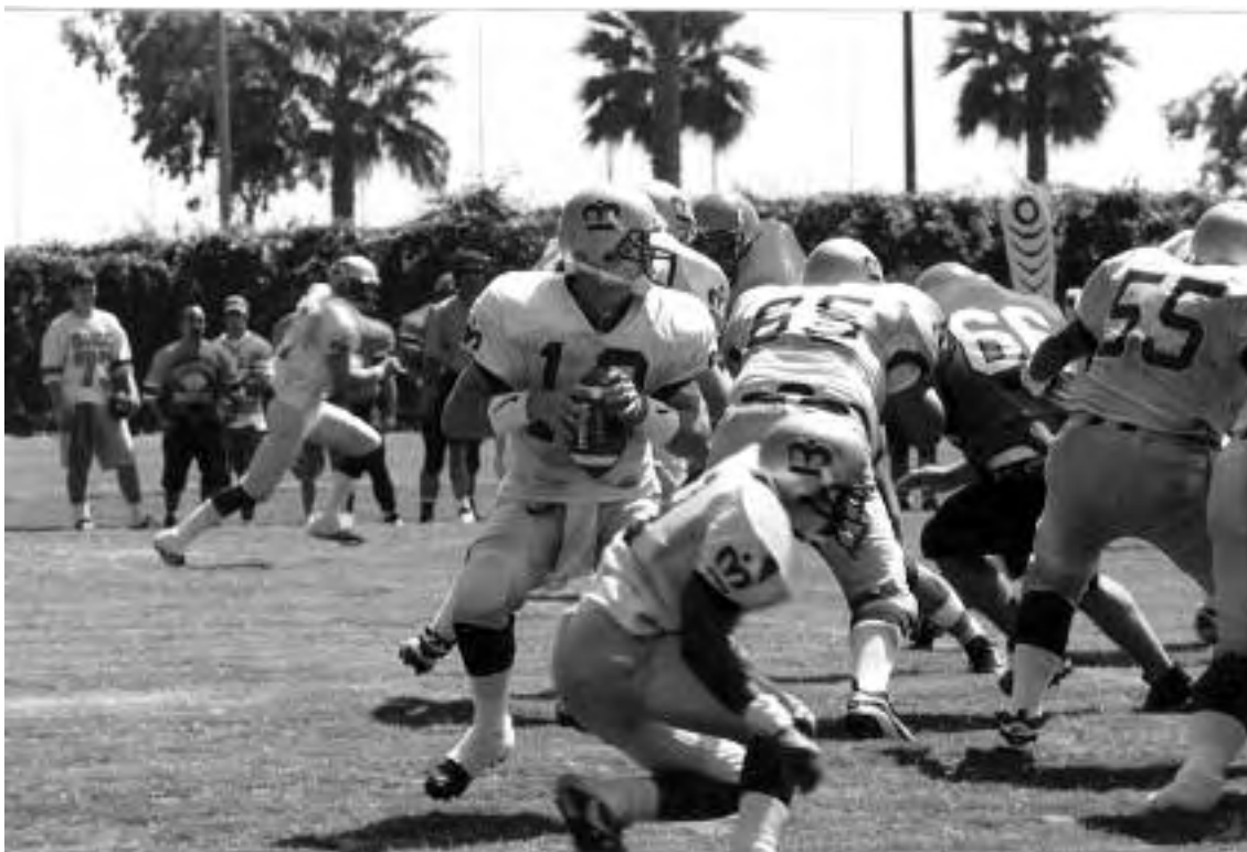
LAVC Football Team