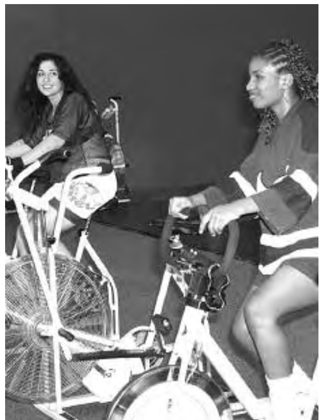
LAVC Fitness Center

Patrons Association of Los Angeles Valley College 5800 Fulton Avenue Valley Glen, CA 91401-4096