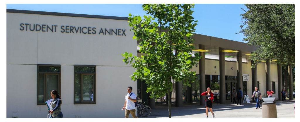
STUDENT SERVICES ANNEX BUILDING

Counseling, Career Transfer Center, Services for Students with Disabilities